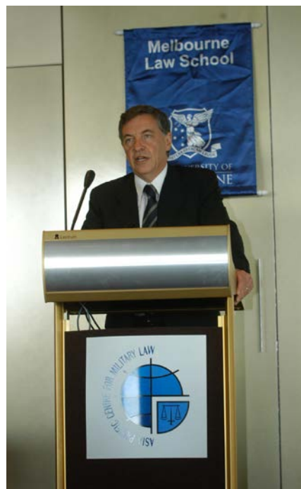
Above: Senator the Hon Robert Hill, Australian Minister for Defence, giving the Opening Speech to the BWC Regional Workshop