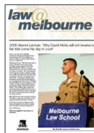
Above: Law@melbourne Issue 13, July 2006